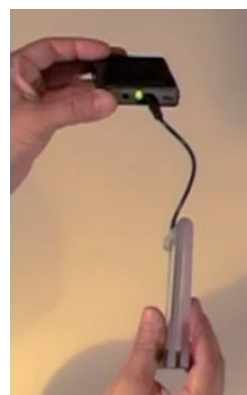
Changing BT-105 profile to iPad mode

you see the first LED blink, then release. The LED will then blink red, then green 3 times, then red. [see fig. 3]